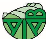
ASSOCIAZIONE ITALIANA PER L'AGRICOLTURA BIOLOGICA