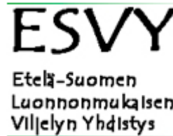
Southern Finland Organic Farmers Association