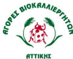
Attiki Association of Organic Farmers Markets